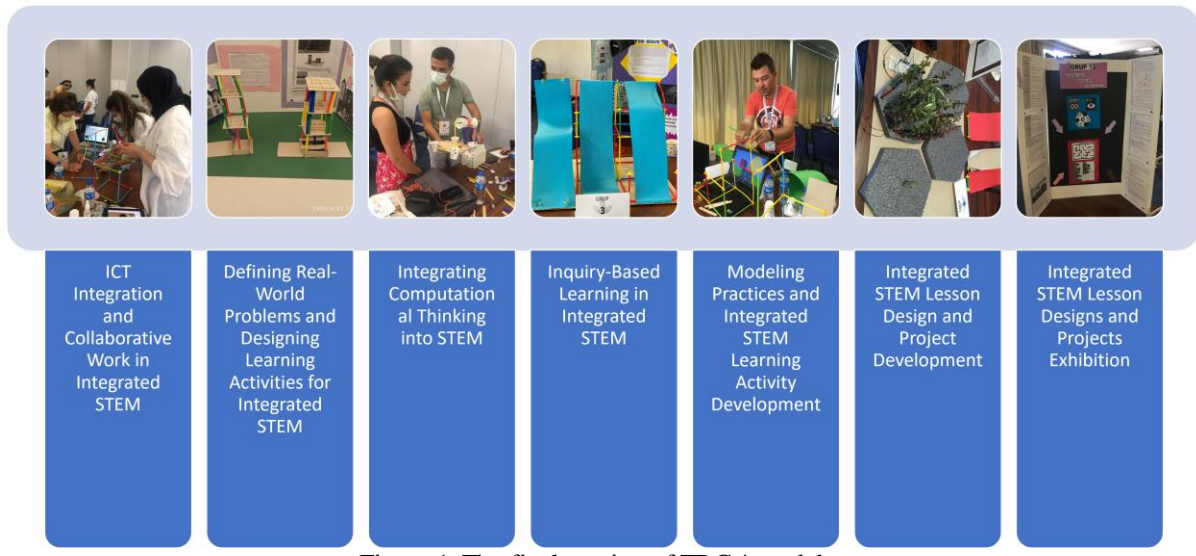
Figure 1. The final version of TDCs' modules

All three TDC were designed in modules. Each TDC has experts in the field of computer science, science, and mathematics education who work as faculty members at universities. The authors participated in the process as principal researchers and experts of these TDCs. All experts and teachers came together from different cities in Turkey. TDCs were organized as "education camps", and experts and teachers stayed together during the program. Teachers had the chance to spend time and consistently exchange ideas with experts and colleagues at breakfast, lunch, dinner, and before and after course sessions.