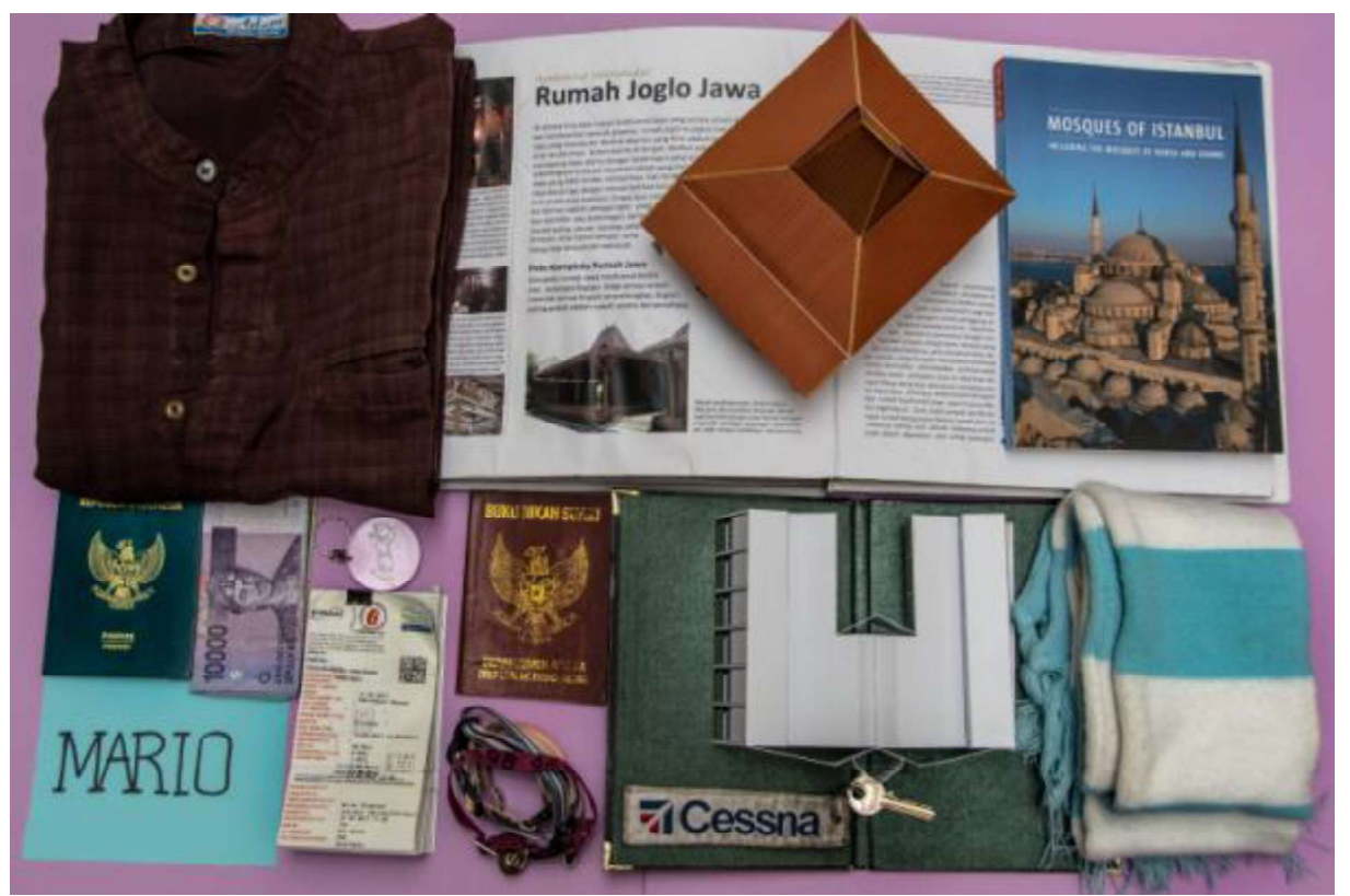
Indonesia, Male, 28