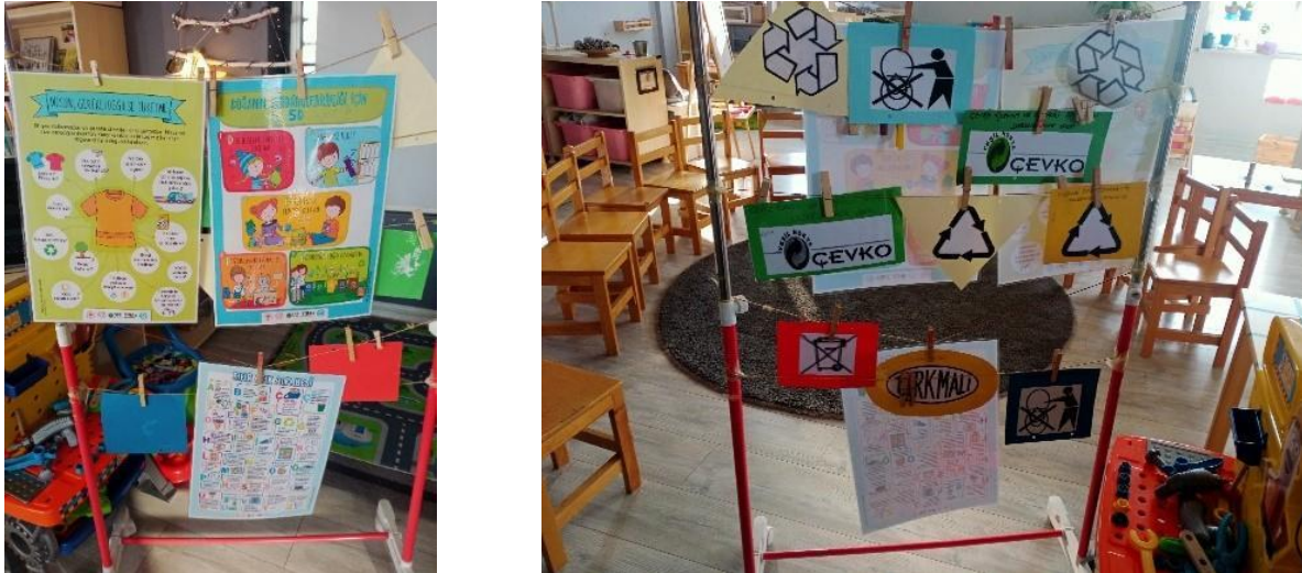
Figure 2. Recycle activity observed on December 20, 2021

Like the post-interview as personal effects of PD, it helped to expand their awareness and knowledge about sustainability, share with colleagues what they learned in PD, and reconsider sustainability-related lifestyles, such as reusing materials and reducing consumption.