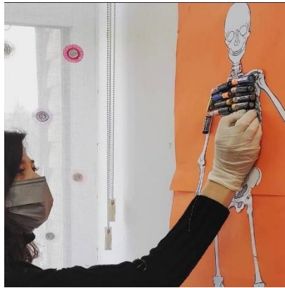
Figure 4. Posted by T3 on December 28, 2021

The teachers stated that the 7Rs, which reflect the themes, and the three pillars of sustainability were the remaining conceptual structures of the PD. It was said that respecting and loving all creatures and behaving respectfully with their lives, needs, past, and future is essential.