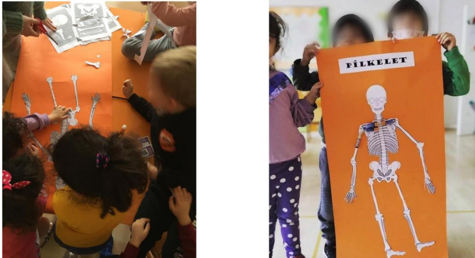
Figure 3. Pilkelet (skeleton) activity observed on December 17, 2021