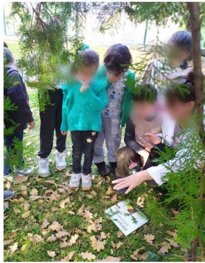
Figure 5. Acorn Activity Observed on November 3, 2021

T2: This is natural. Children! Animals have basic needs like us. Be careful not to step up. They become fertilizer for the soil and blend with nature.”