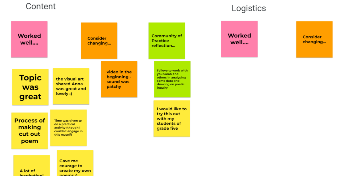
Figure 2: the Jamboard feedback