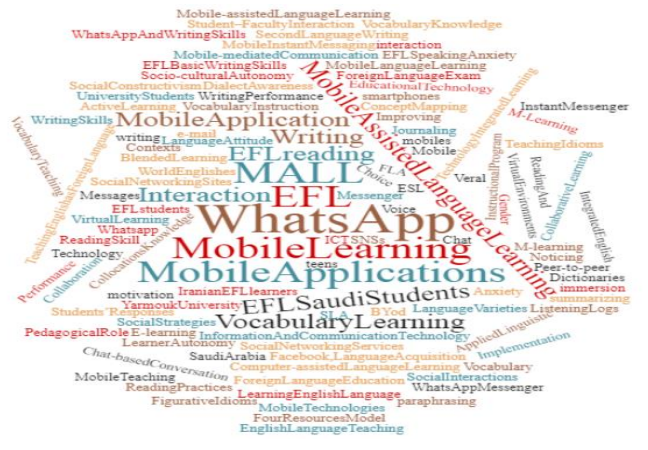
Figure 2. The keyword cloud of the keywords

The keywords were analysed by copying all of them from the selected articles and putting them in Vocab Profiler (http://www.lextutor.ca/vp/eng/), a website that analyses texts for types and tokens. In addition, a keyword cloud is provided (Figure 2) to illustrate the prominent keywords and thus to show the way WhatsApp is used in the empirical studies. Except for two articles, all of the articles had keywords. There were 158 keywords which had 84 types (i.e. a unique word) and 171 tokens (i.e. any occurrence of the types).